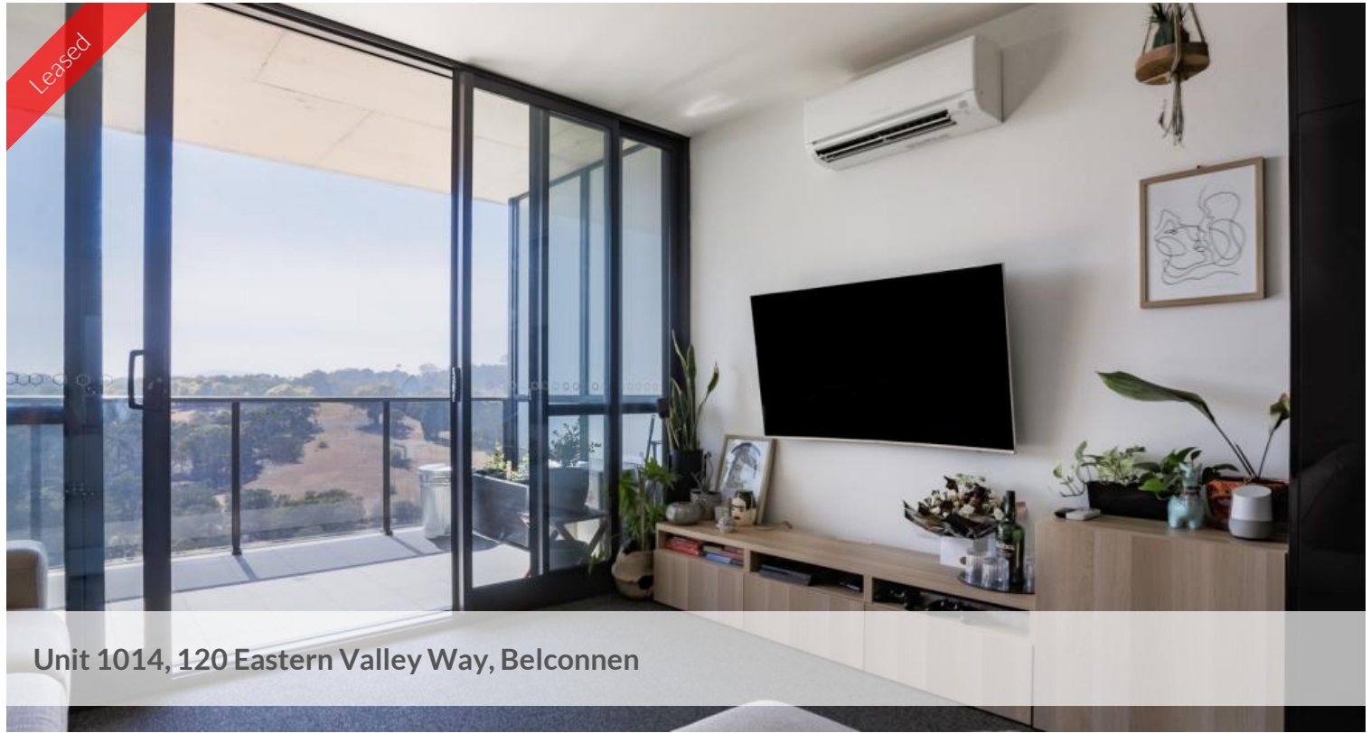
Unit 1014, 120 Eastern Valley Way, Belconnen