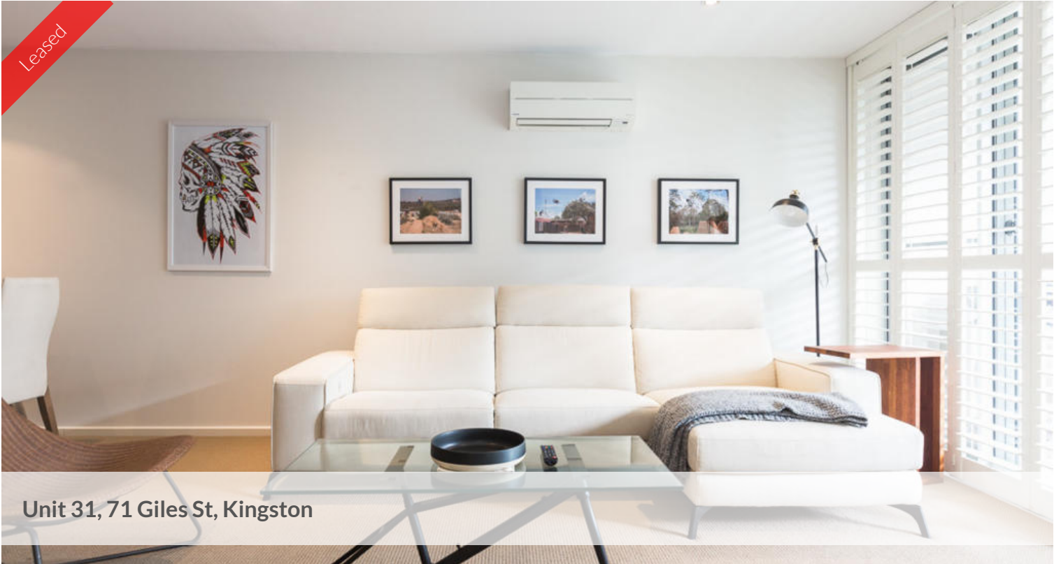
Unit 31, 71 Giles St, Kingston