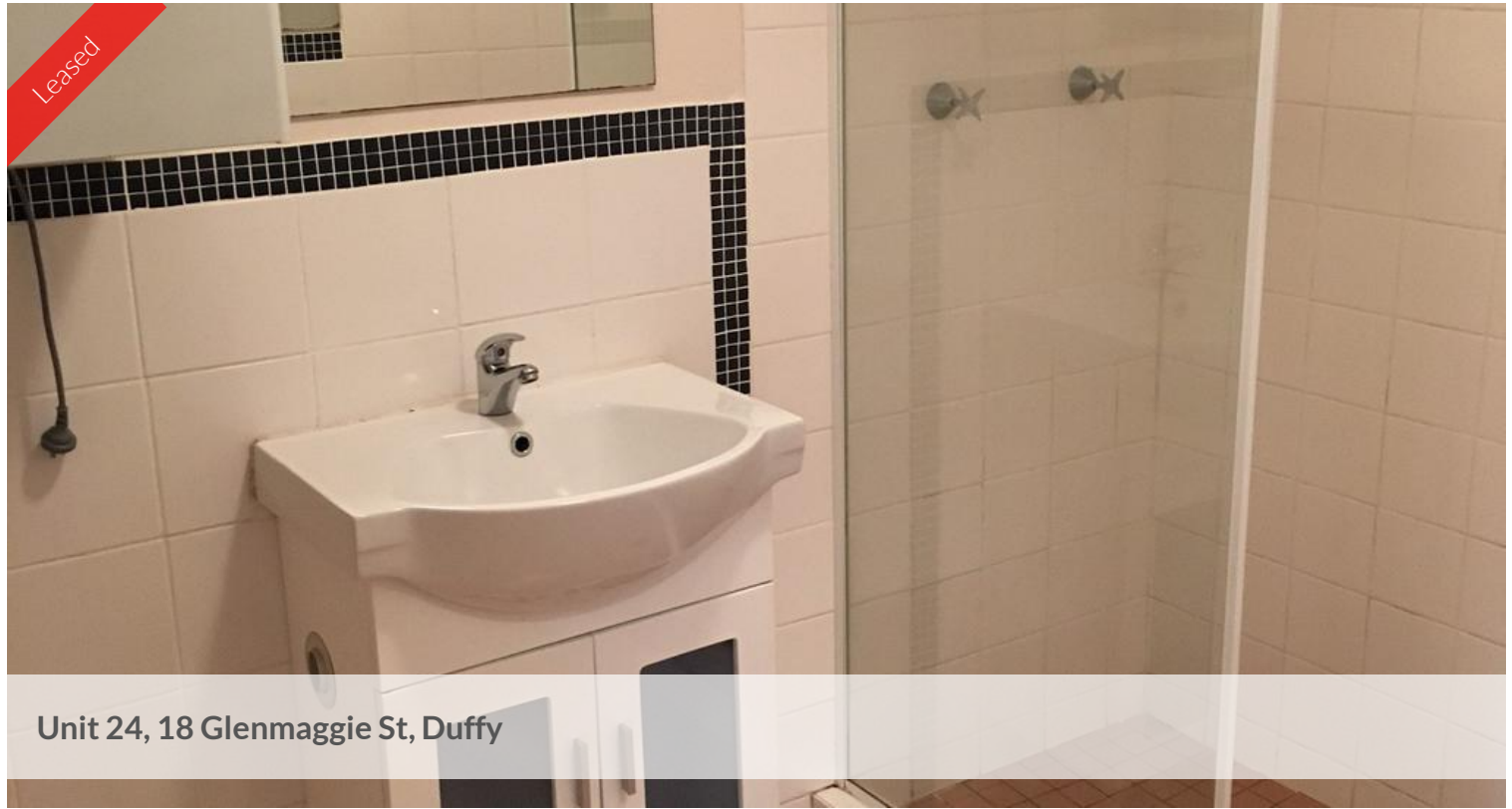
Unit 24, 18 Glenmaggie St, Duffy