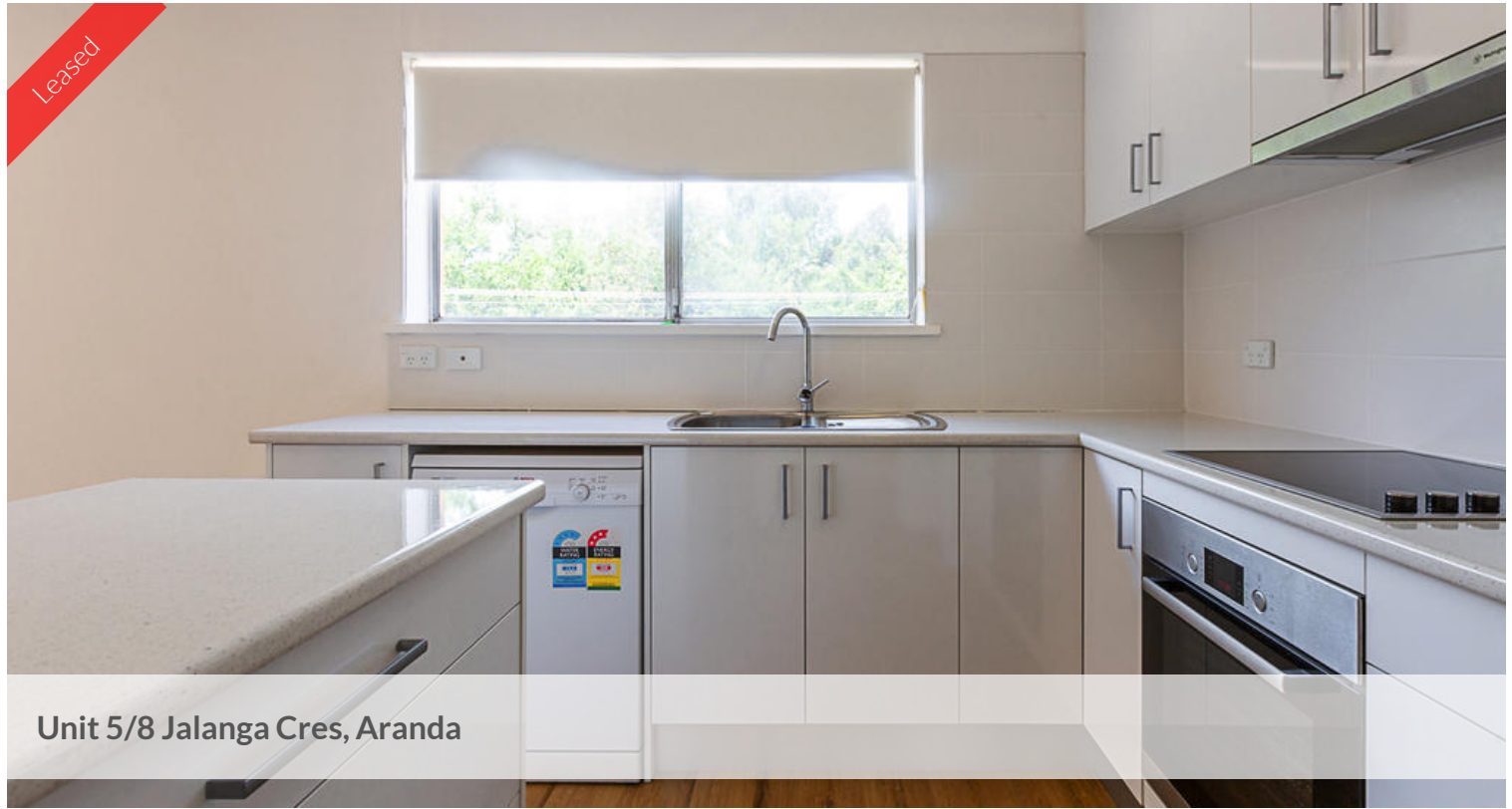
Unit 5/8 Jalanga Cres, Aranda